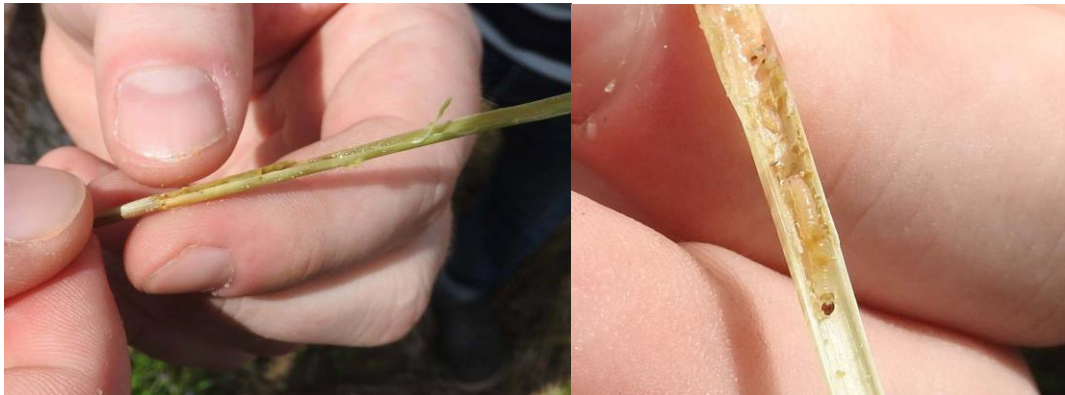
Fig. 3. Rice stem borer and its injury in a rice planting in Takeo.