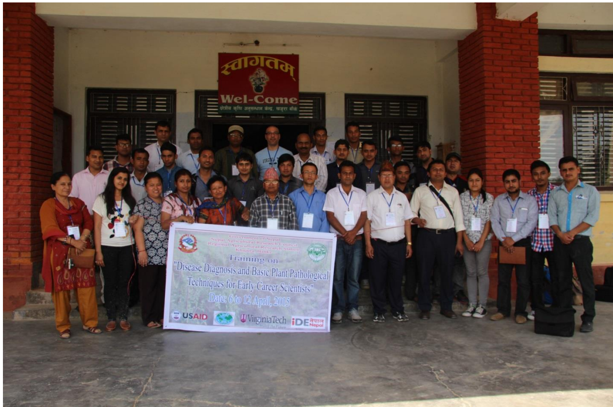
Workshop participants, Khajura, Banke

We gave an overview of virus disease diagnosis, and visited the labs in preparation of the ELISA and other lab activities. We visited B. Gaun and collected samples from cucumber, pumpkin, eggplant, and bottle gourd plants showing virus-like symptoms.