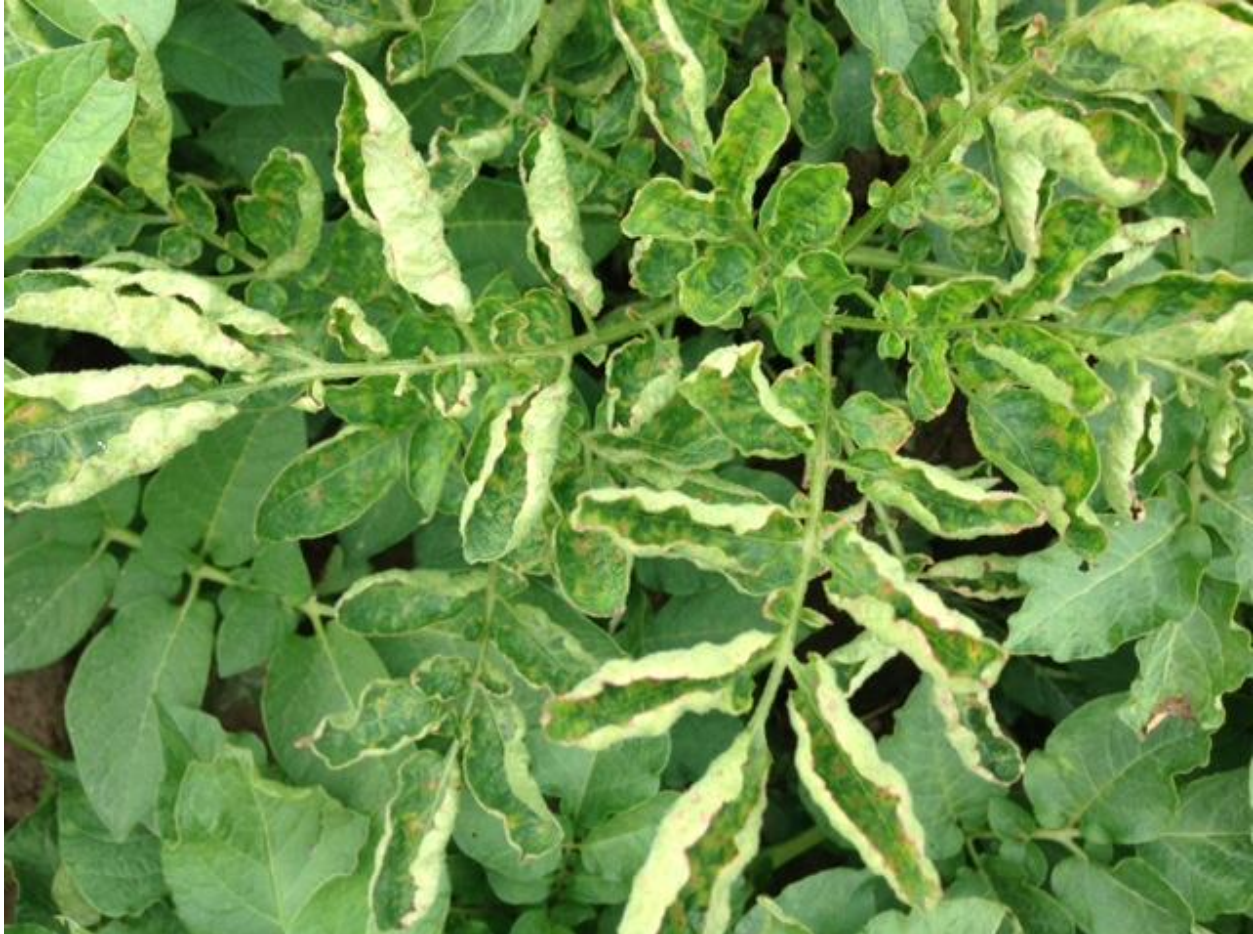
Potato plants showing virus-like symptoms

April 12: We visited fields in Bame and collected samples from beans, broadleaf mustard and potato showing virus-like symptoms. We visited a KISAN site and noticed lack of using IPM components like Trichoderma , staking cucumbers. We advised farmers to stake cucumber plants to prevent fungal diseases, especially since downy mildew was causing severe damage. We traveled to Dhorchour observed chili and tomato plants showing severe damping off damage. The farmer had his seedling nursery in the field, unprotected. Tomato plants showed insect damage to the stem.