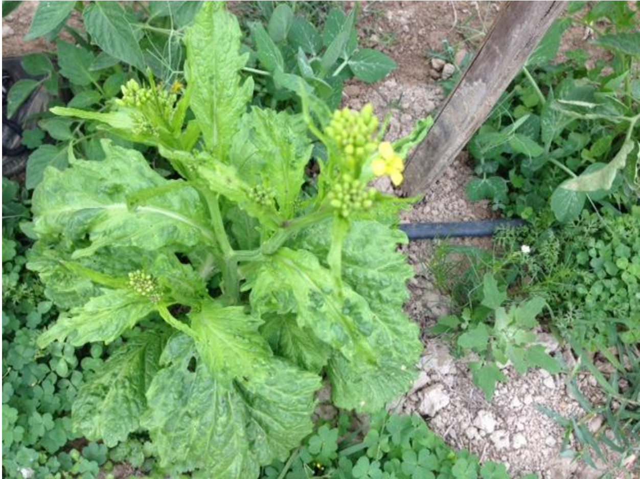
Broadleaf mustard showing virus-like symptoms

April 15: We visited the USAID mission in Kathmandu and briefed about our workshop and field visits. We also made a PowerPoint presentation describing results from previous field visits and discussed future plans. We also visited the iDE office and assessed the visit and future plans.