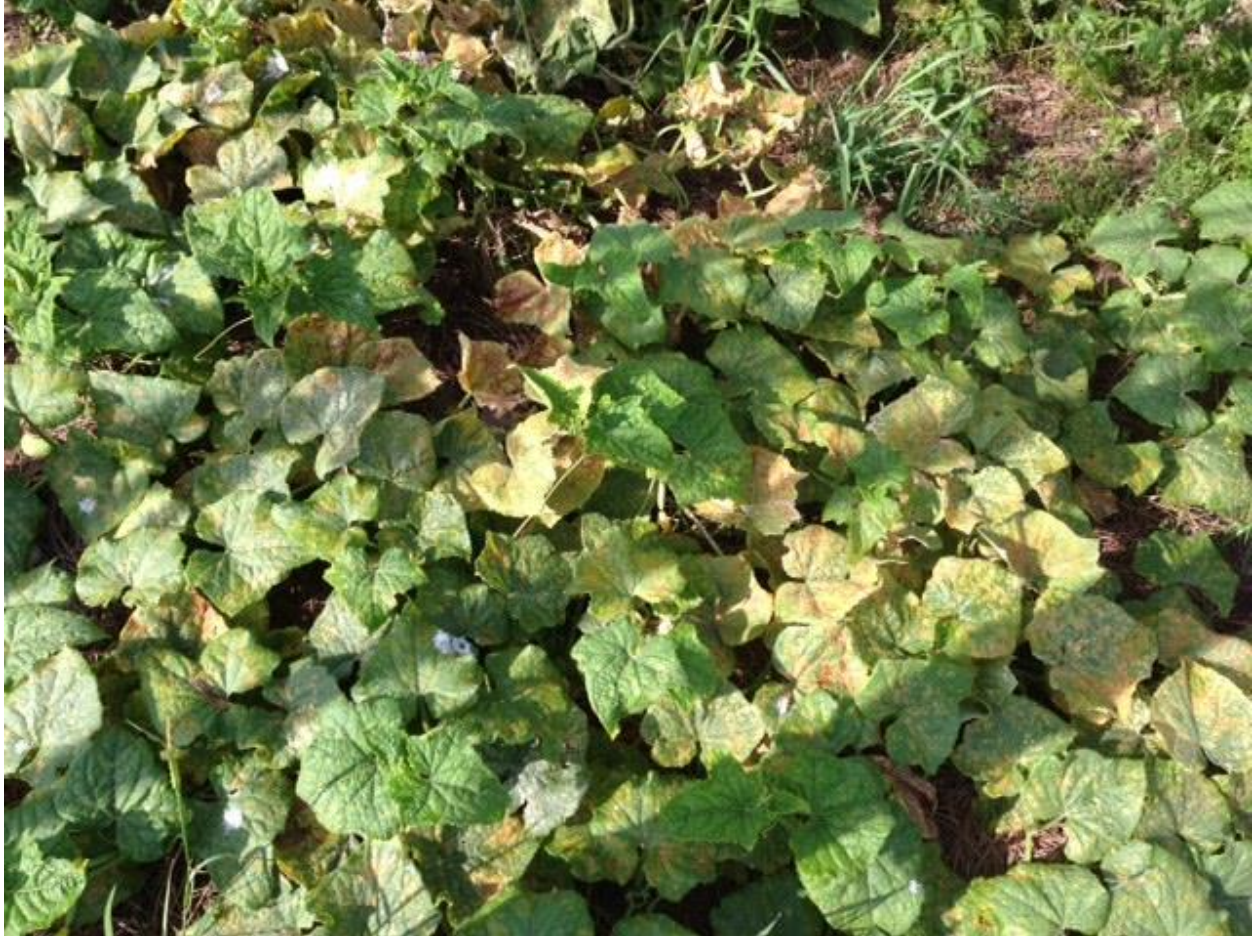
Cucumber plants showing severe downy mildew damage

In Luham, we visited 1 year old tomato crop in tunnels. Plants showed mosaic symptoms, yellowing and slight leaf curl. DADO officers had told farmers to spay cow milk to control viruses. We explained that this practice is not effective and discussed alternative methods for managing virus diseases. Samples collected from all locations were processed and pressed on FTA cards.