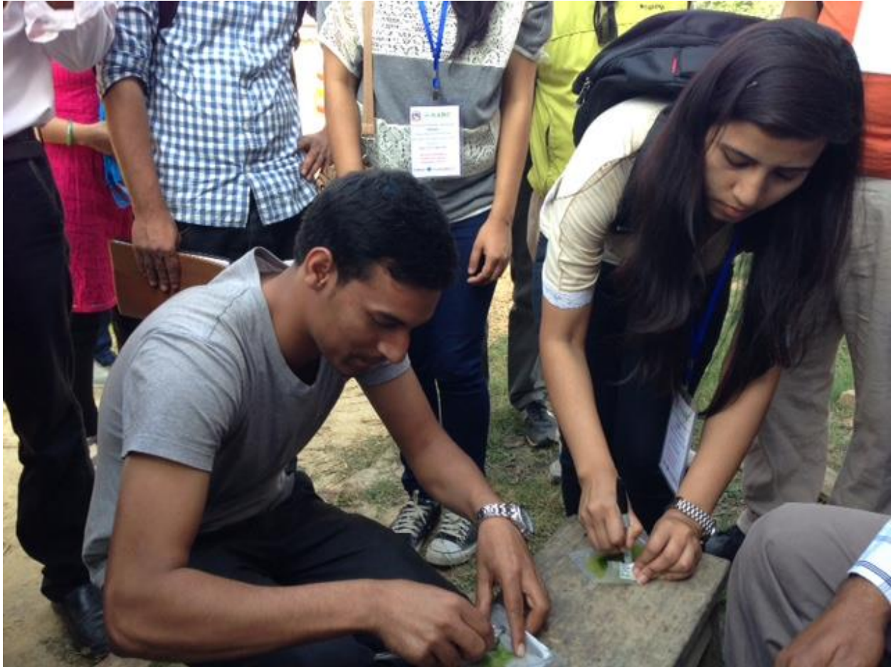
Workshop participants practicing use of immunostrips in the field