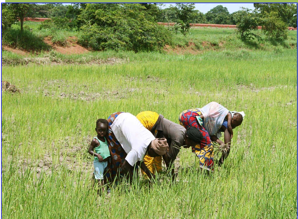
Women weeding rice in the 130 ha USAID /IICEM rice project (Plaine Rizicole des Femmes de Niena) at Niena village, Sikasso Region, Mali. Note child at left and baby on back of woman at right.